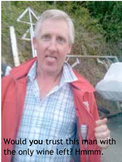
Would you trust this man with the only wine left? Hmmm.

FOR SALE DEVON YAWL DY 305 Mid blue hull with red antifouling White Scanes sails new 2009 2.5 Mercury outboard, anchor, cover etc. Almost New Road Trailer Good racing record. Lying Topsham Could store until Spring 2011 £6,500